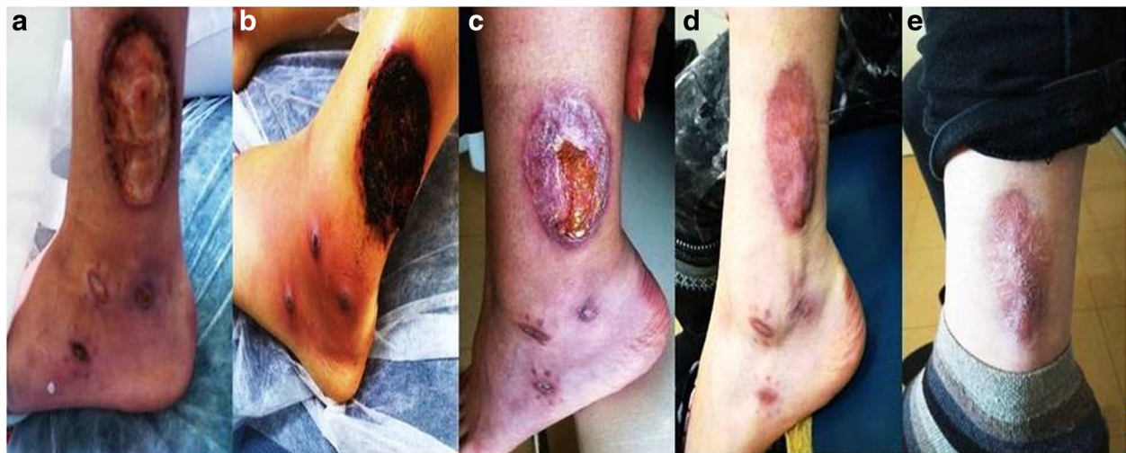
Fig. 1 Images of ulcerated areas. a On admission. b A week later. The swelling and the inflammation are noted. c One month later. Significant improvement of the ulcerating areas. d At 6 months. The inflammation has subsided, with further improvement of the ulcerating areas. e At one year. No new ulcers and healed old ones

On follow up a month later she was feeling well, with no ankle swelling, and with all ulcers healing satisfactorily (Fig. 1c). Six months hence she was on 4 mg methylprednisolone, 100 mg cyclosporine, and 7.5 mg methotrexate, with normal liver enzymes, and with the ulcers nearly healed (Fig. 1d). Cyclosporine was discontinued at 8 months, and a year later the patients was on 4 mg methylprednisolone and 7.5 mg methotrexate, with further improvement and complete healing of the ulcers (Fig. 1e).