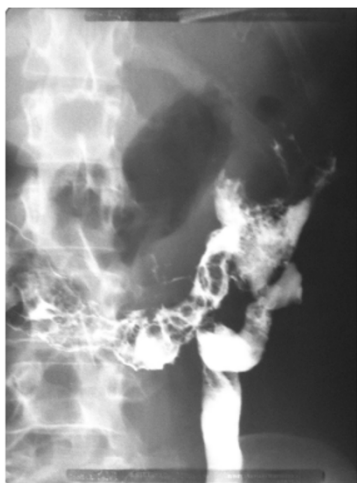
Figure 3 The specimen-severe form of Crohn's colitis with forceps pointing fistulous opening.

harbored the signs of inflammation but was relatively spared compared to the transverse and left colon.