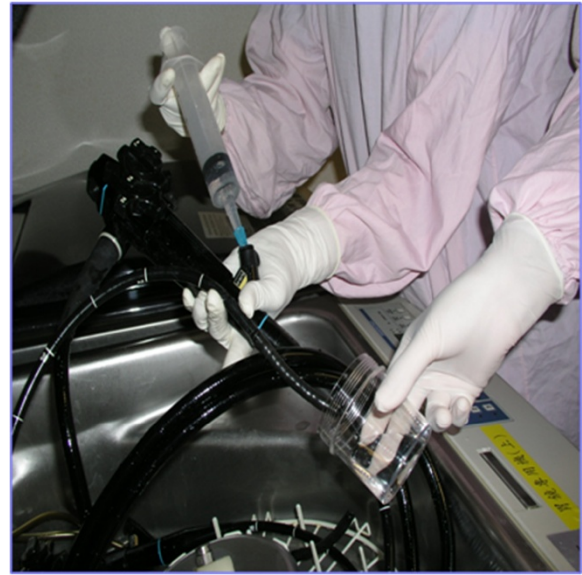
Figure 1 Cultures of rinse samples from GI endoscopes.

This 5-year (February 2006–January 2011) prospective study was performed at Chang Gung Memorial Hospital, Kaohsiung Medical Center, Taiwan. Every month, we took random consecutive swabs and BC samples from 7 AERs (including 5 reprocess to gastroscopes and 2 reprocess to colonoscopes). A total of 420 samples were obtained by rinsing the BCs of gastroscopes and colonoscopes, and 420 swab samples of residual water were collected from the internal surfaces of the AERs after a complete reprocessing cycle. Of these 840 samples, 600 were from gastroscopes (300 samples each from BCs and 300 from AERs reprocess to gastroscopes) and 240 from colonoscopes (120 samples each from BCs and 120 from AERs reprocess to colonoscopes). The rinse samples were obtained by flushing the BCs with 50 ml sterile distilled water under highly aseptic conditions (Figure 1). The distilled water was contained in an aseptic vial (20 mL/vial) manufactured for medical use. The residual water, after flushing, was collected in a sterile container and plated on blood agar, MacConkey agar, and Lowenstein–Jensen medium. We collected swab samples of the residual water from the internal surfaces of the AERs after a complete reprocessing cycle (Figure 2). Swabs were placed in liquid thioglycollate broth for primary culture.