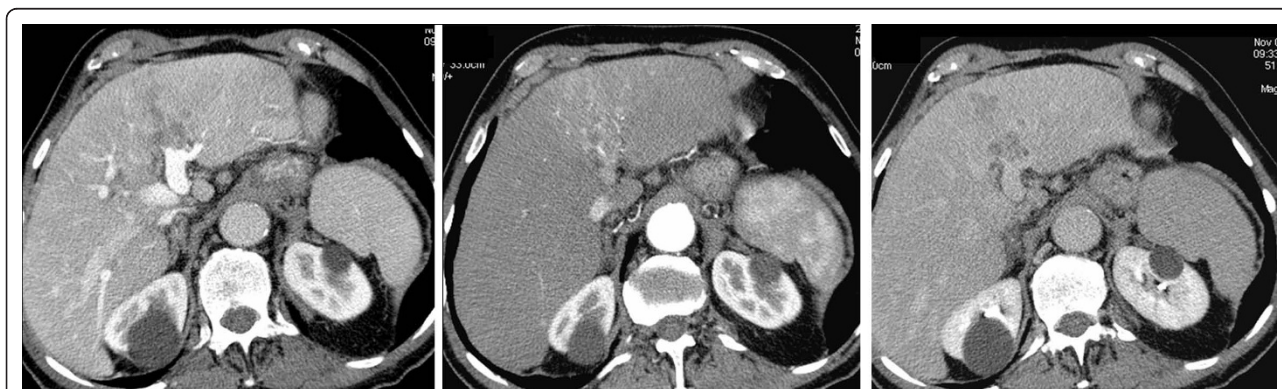
Figure 1 Baseline CT examination: 1a, arterious phase; 1b, portal phase; 1c, late phase. Between III and IV hepatic segment is possible to observe the presence of a solid lesion with poorly defined margins and infiltrative nature; the lesion is hyperdense in arterial phase and hypodense in the portal phase and late, and it invades the left main portal vein which is thrombosed.

3rd assessment (after six months) - After six months of treatment with sorafenib the AFP value accounted for 2.3 ng/ml. The MRI (Signa HDx; GE Healthcare, Milwaukee, WI) with liver-specific contrast medium (Primovist, Bayer Schering) (figure 3) did not identify at all the lesion at segment III and IV. The portal trunk was pervious and no other hypervascular lesions in the liver parenchyma were seen. The parameters of liver