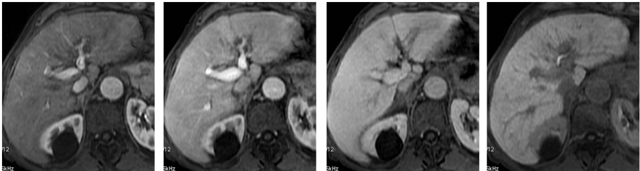
Figure 4 Twelve-months follow up with MRI before and after injection of Primovist: 5a, T1-weighted; 5b, T2-weighted: On baseline T1w.i and T2w.i no sign of changes of signal intensity within the liver parenchyma is appreciable, not even at the level of the previous lesion of segment III.

the present case seems definitely unusual since it occurred in an elderly patient with infiltrating disease and portal thrombosis which, as it is well-known, represent the main negative prognostic factors for HCC. In our experience, the 84-year old patient showed a good tolerability to treatment and the incidence and severity of adverse event did not differ from data reported in the pivotal studies carried out in HCC. Additional information supporting the use of sorafenib in elderly patients can be found in studies evaluating sorafenib in renal carcinoma [13,14] which indicate that in these patients a benefit can be achieved as in the younger ones provided that a careful monitoring of adverse event is done [15]