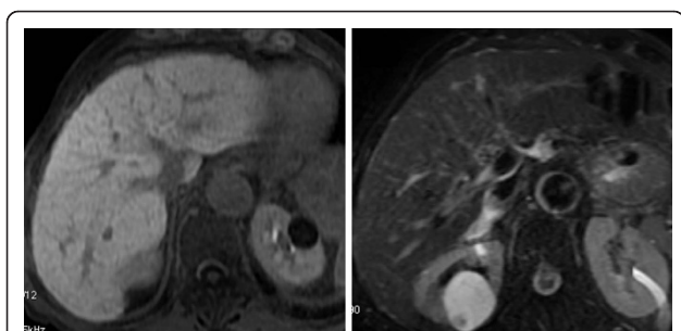
Figure 6 Analysis of metallo-proteinase 9 serum level: A clear reduction of marker serum level is observed after three months of treatment.

measure of patient response to the treatment [17]. It has been hypothesized that sorafenib could exert a dual activity: the first one directly on neoplastic cells and the second one through a modulation of pro-thrombotic cytokines [16].