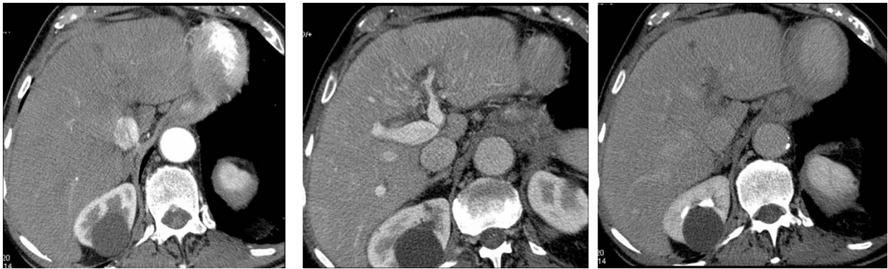
Figure 2 Three-months follow-up with CT: 2a, arterial phase; 2b, portal phase; 2c, late phase. The three months CT scan document an apparent reduction in the size of lesion, which is associated with partial recanalization of the left portal branch.

function were unchanged. In agreement with RECIST evaluation criteria, the disappearance of all the target lesions led to classify a complete response.