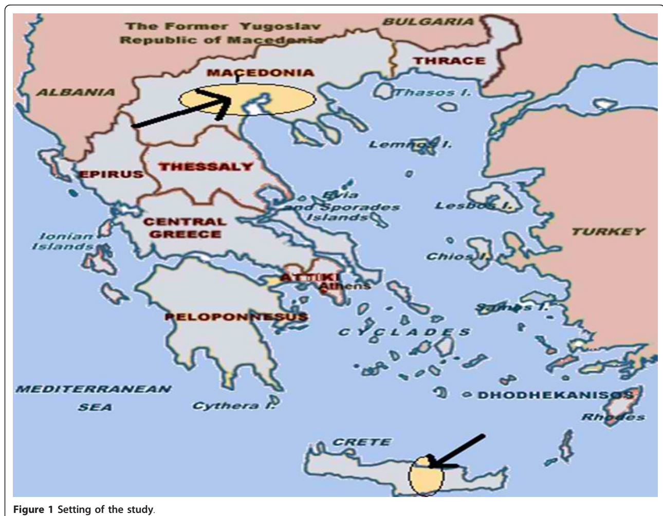
Figure 1 Setting of the study.

Five rural practices in Greece (three from the Greek region of Macedonia and two from the island of Crete), serving 21,100 residents in total were included in this study. The two areas differ only in terms of geography. The setting of the study is illustrated in Figure 1.