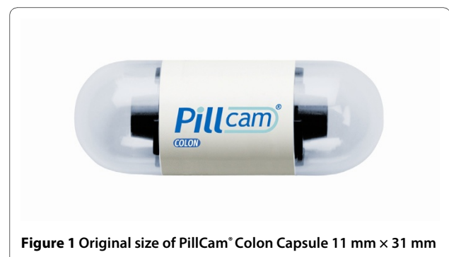
Figure 1 Original size of PillCam ® Colon Capsule 11 mm × 31 mm

The PillCam ® Colon Capsule is 11 mm × 31 mm in size (Figure 1). It is equipped with two wide-angle (156°) cameras acquiring pictures from both ends of the capsule at a rate of 4 frames per second (2 pictures per second and