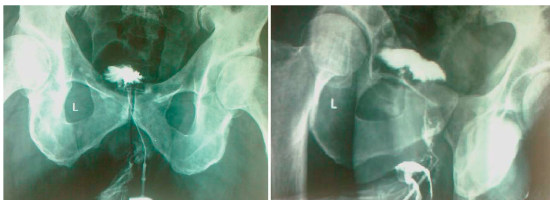
Figure 1 Fistulography showing the tractus of the fistula.

further, discuss tips and tricks when applying fibrin glue as plugging material in fistulas.