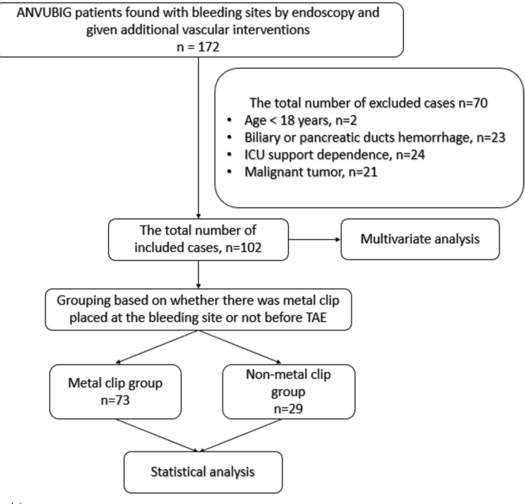
Fig. 2 Flow diagram of study subjects

The clinical success rate of the metal clip group was higher than that of the no metal clip group (82.2% vs 55.2%, respectively, P < 0.001), and the rebleeding rate (8.2% vs 27.6%, respectively, P=0.039) of the metal clip group was lower than that of the no metal clip group. The additional surgery rate of the metal clip group was lower than that of the no metal clip group (11.0% vs 20.7%, respectively, P < 0.001). There were statistical significance for all of the differences. The mortality rate in the metal clip group was reduced compared with that in the no metal clip group (11.0% vs 24.1%, respectively, P = 0.146), although there was no significant difference, which might be related to the limited sample size. There was no statistically significant difference in hemoglobin levels at discharge, postoperative minimum hemoglobin, postoperative blood transfusion, postoperative organ failure, postoperative hospital stay and total expense. (Table 3).