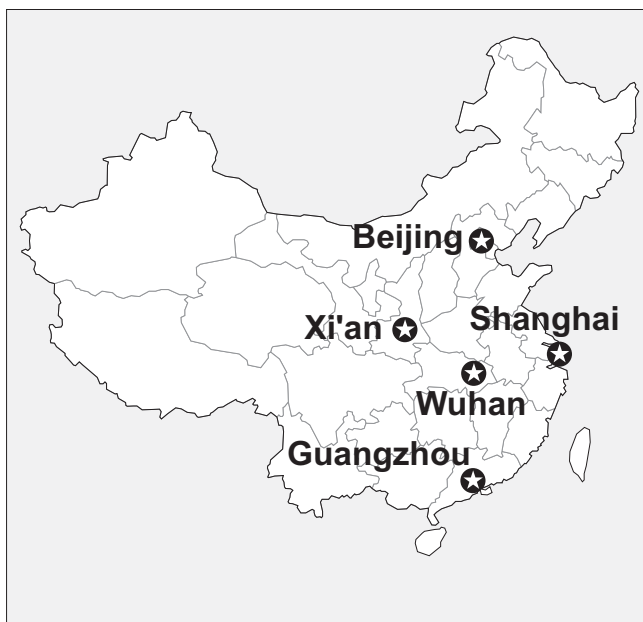
Figure 1 The five study regions in China.

areas were randomly sampled from the urban blocks, and one or more villages from the rural townships.