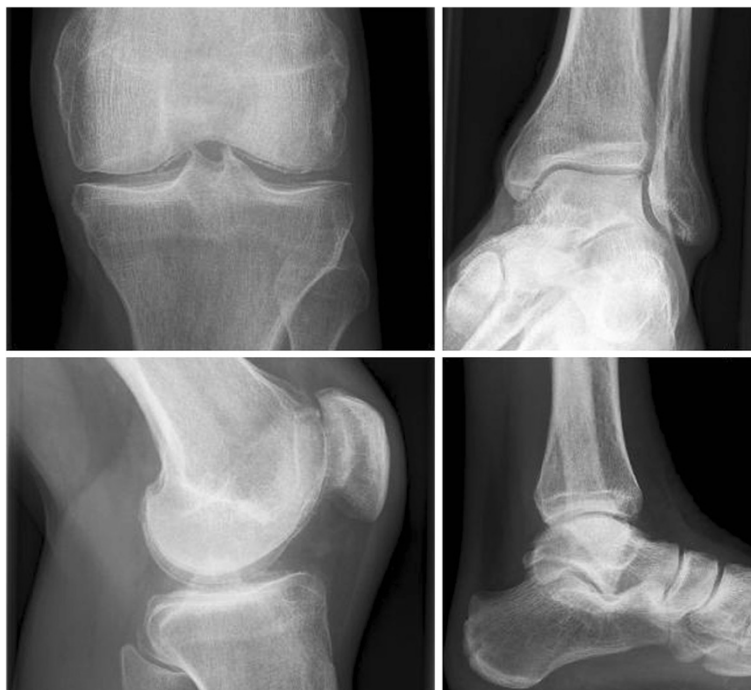
Figure 2 Radiologic findings of CPPD inflammatory arthritis (chondrocalcinosis) with tiny calcification of menisci and of hyaline cartilage in knees and ankles in SBS with extreme hypomagnesemia.

consume high caloric liquid foods, foods rich in Mg, lipids (mostly medium-chain triglycerides), vitamin D and proteins (e.g. curds with fat content of 20 – 40%). 4. Further oral trace elements, folic acid and Tinctura opii normata (containing 0.9-1.05% morphine, 0.1% codeine and 0.3% thebaine (Maros GmbH, Fürth, Germany) as an antiperistaltic agent were administered orally. Pancreatic enzymes were prescribed to increase digestive capacity of the gastrointestinal tract, as underweight, multiple food