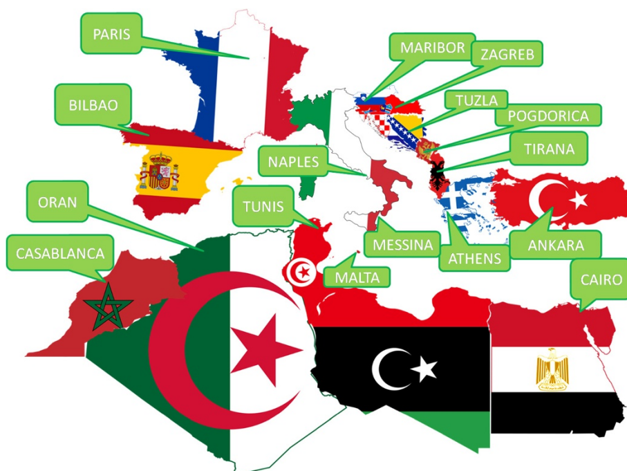
Figure 1 Map of referral centers in the participating countries.

Based on the facilities and tests available in each center, for each case we estimated the probability of being diagnosed with CD by the new ESPGHAN diagnostic criteria alone, without small intestinal biopsy. For each case we summed up the number of diagnostic criteria met (clinical symptoms, tTG above 10 folds the upper limit of normal and specific HLA). The sum of the criteria determined the final diagnostic score, which thus ranged from 1 to 3. To reduce large tables, countries were often aggregated within their geographical region (Europe, Balkans, North Africa).